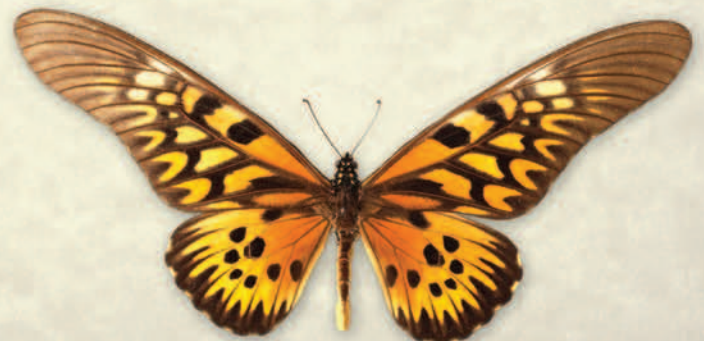
AFRICAN GIANT SWALLOWTAIL