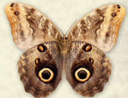
OWL'S EYE BUTTERFLY