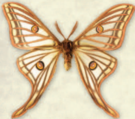
SPANISH MOON MOTH