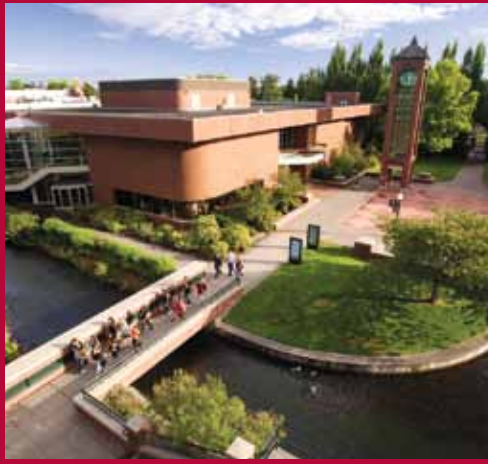
Salem, Oregon – Willamette University's Main Campus