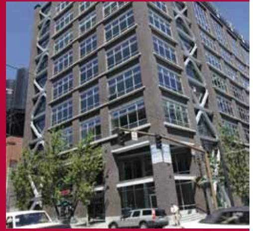
Portland, Oregon – Willamette University's Portland Center, Pearl District