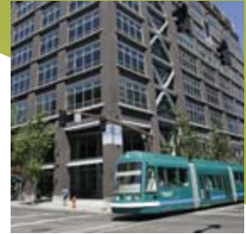
Willamette University Portland Center 1120 NW Couch St. Suite 450 Portland, OR

Take Action Register online for the entire SEC certificate program or for individual sessions at willamette.edu/mba/sustainability 503.370.6791